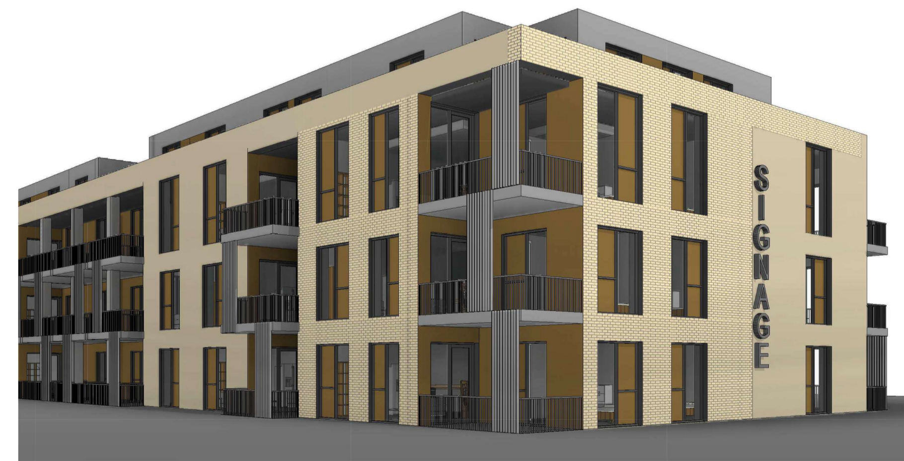
3 3D View.

NOTE: Levels shown on architectural block plans relate to local Ground Floor Level and do not relate to Ordnance Datum. For Finished Ground Floor Levels related to Ordnance Datum see DBPL Engineers drawings numbered: 180002-2000 Roads Layout / 180002-2001 Roads Layout Sheet 1 / 180002-2002 Roads Layout Sheet 2